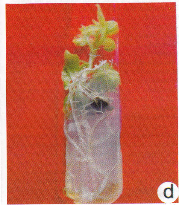
(d) Root formation on M S medium supplemented with IAA (1 mg/l).