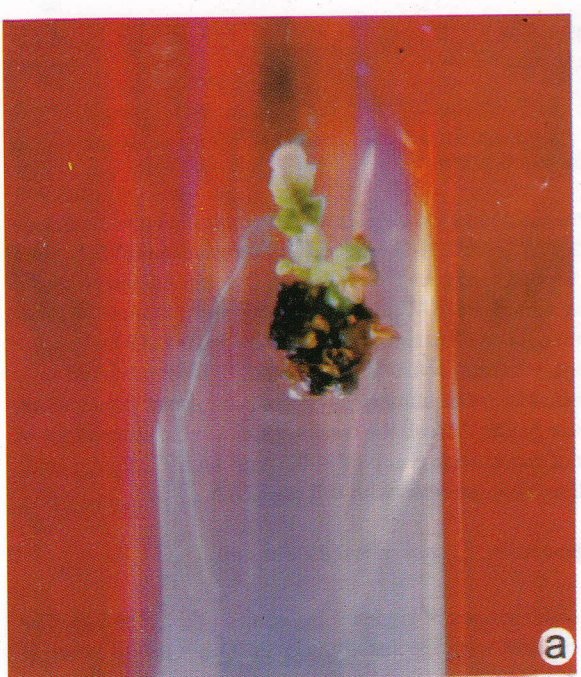
(a) Shoot formation on M S + IAA (1.0 mg/l) + BAP (5.0 mg/l).