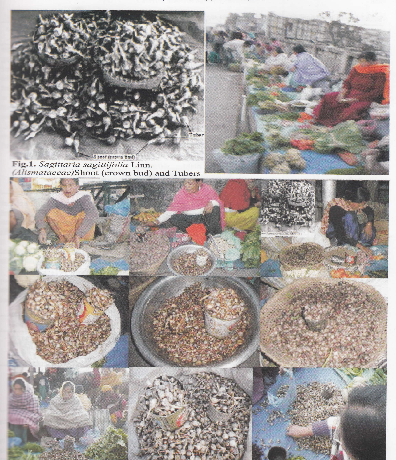
Fig.2. Sagittaria ssagittifolia sold in the markets of Manipur