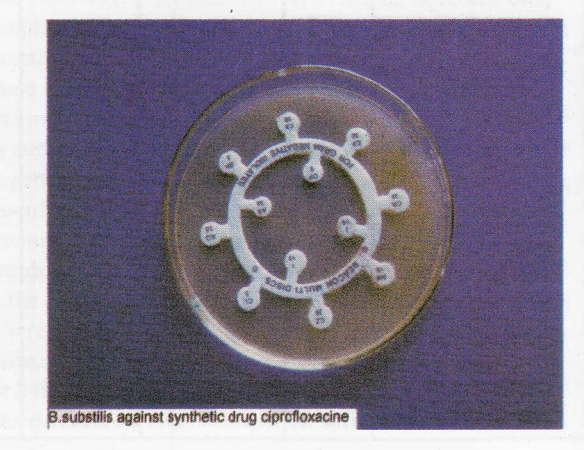
Fig.1. Nutrient - agar media showing inhibition zones in response to representative plant extracts.