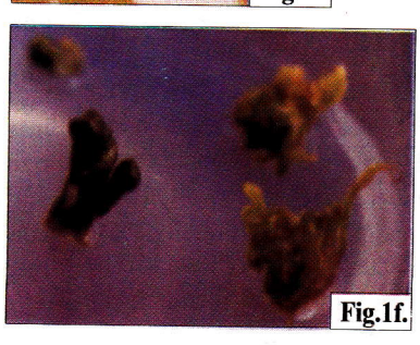
Fig.1f. Somatic embyros are developing into plantlets through heart and torpedo shaped stages.