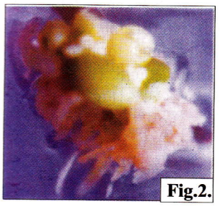
Fig.2. Somatic embryos were developed along with rhizogenesis when cultured on MS medium in presence of either 2, 4-D(4 mg/1) or IAA(1 mg/1).