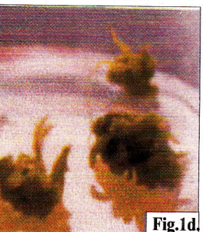
Fig.1d. Shoots were developed either singly or multiple in number on the somatic embryos.