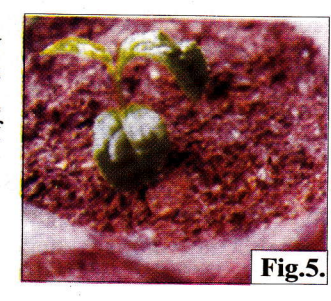
Fig.5. Plantlet regenerated from the somatic embryo in a MS medium containing Brassin (2 mg/1) + GA, (1.5 mg/1) and 1% agar. Then the plantlet transferred to potted soil after 6-8 weeks of germenation on the above medium.