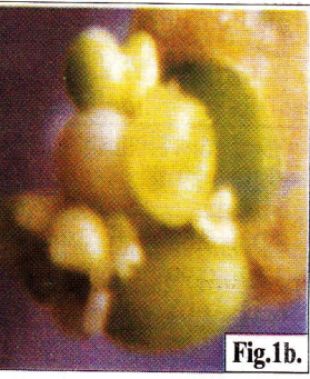
Fig.1b. Cup-shaped somatic embryos, which were pale yellow to creamy-greenish in colour.

Fig.1a. Seed-like somatic embryos with large cotyledons, like those of zygotic embryos. The seed-like embryos developed into whole plant only those were with partially fused cotyledons.