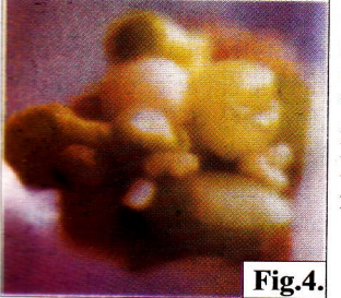
Fig.4. Secondary somatic embryogenesis were obtained in MS/B, medium in presence of BAP (5 mg/1). + IBA (1 mg/1) or IAA (2 mg/1).