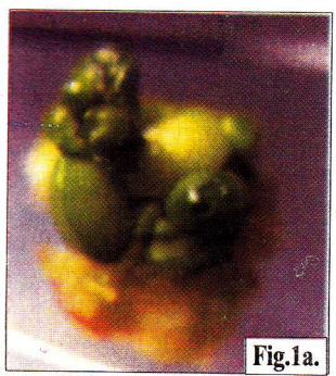
Fig.1a. Seed-like somatic embryos with large cotyledons, like those of zygotic embryos. The seed-like embryos developed into whole plant only those were with partially fused cotyledons.