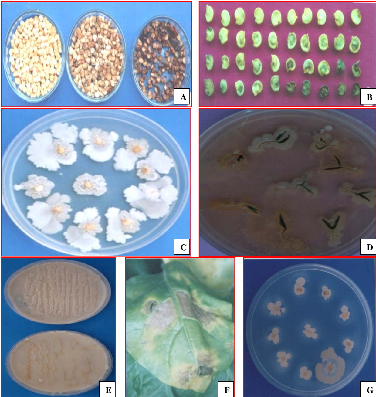
Fig.1. Infection of Xanthomonas axonopodis pv. vesicatoria in chilli, (A) Seeds categorization into asymptomatic (left), moderately discoloured (middle) and heavily discoloured (right) showing degree of discolorations, (B) degree of discoloration, asymptomatic (upper most) to moderately discoloured (lower row) and heavily discoloured (lower last two rows) showing degree of discolorations, (C & D) Characteristic off white, shiny, raised with undulated margin of colonies on and around seeds and seedlings on incubation on NA agar medium, (E) Characteristic yellow or off white, mucoid, shiny and raised colonies on YDC agar medium, (F) hypersensitivity reaction (HR Reaction) on tobacco leaf showing positive reaction, (G) Bacterial isolates showing positive lipase activity on Tween-80 medium on incubation on and around seeds.