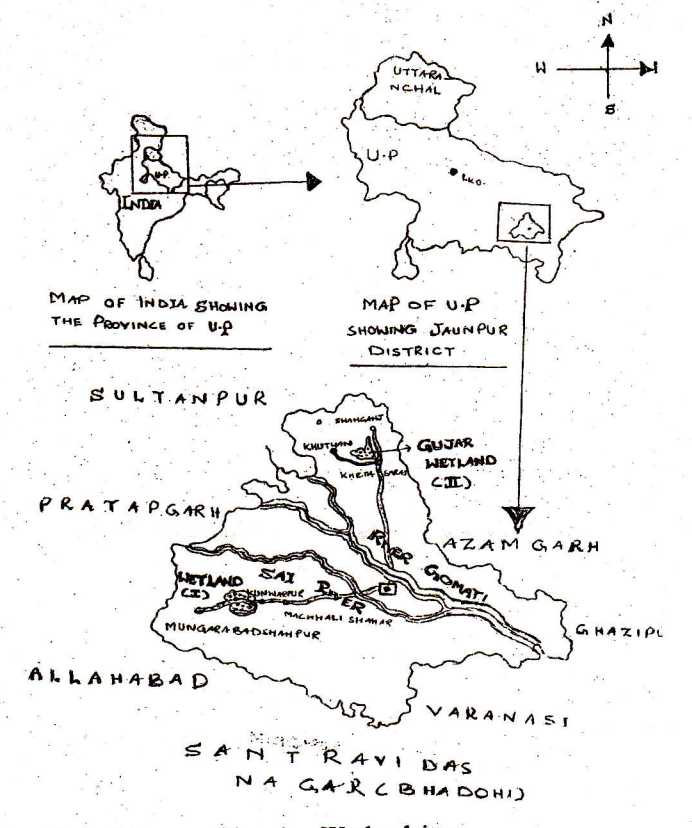
Fig. 1. Location Map of Jaunpur Showing Wetlandsites.