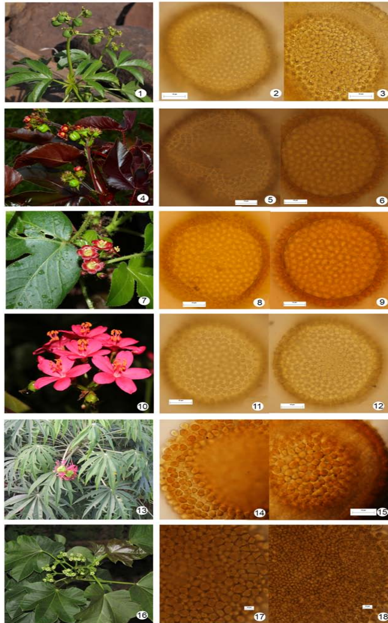
Plate 1. Pollen morphology of species of Jatropha ; 1 – Floral twig of J. glandulifera ; 2-3 – Pollen of J. glandulifera ; 4 – Floral twig of J. gossypifolia ; 5-6 – Pollen of J. gossypifolia ; 7 – Floral twig of J. gossypifolia variant; 8-9 – Pollen of J. gossypifolia variant; 10 – Floral twig of J. integerrima ; 11-12 – Pollen of J. integerrima ; 13 – Floral twig of J. multifida ; 14-15 – Pollen of J. multifida ; 16 – Floral twig of J. tanjorensis ; 17-18 – Pollen of J. tanjorensis .

variant and J. tanjorensis belong to section Jatropha and aligned with the previous studies based on their vegetative morphology and epidermal and petiole anatomy 1,20-21 .